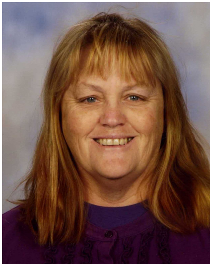
Christian Pastoral Support Worker